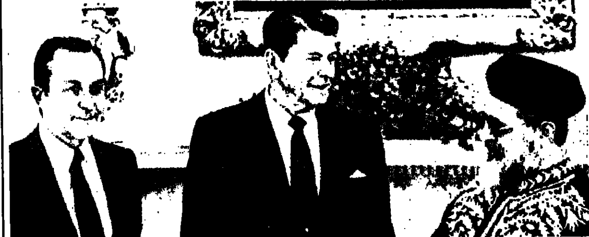
Sephardi Chief Rabbi Ovadia Yosef meets with President Ronald Reagan in the White House oval office last Thursday. At left is Israel Ambassador Moshe Arens.

The dissident was sentenced to 13 years in prison after conviction on charges of "spying" for the U.S. Mrs. Shcharansky said her husband wanted to emigrate to Israel.